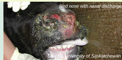
Red nose with nasal discharge