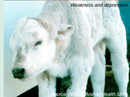
Weakness and depression